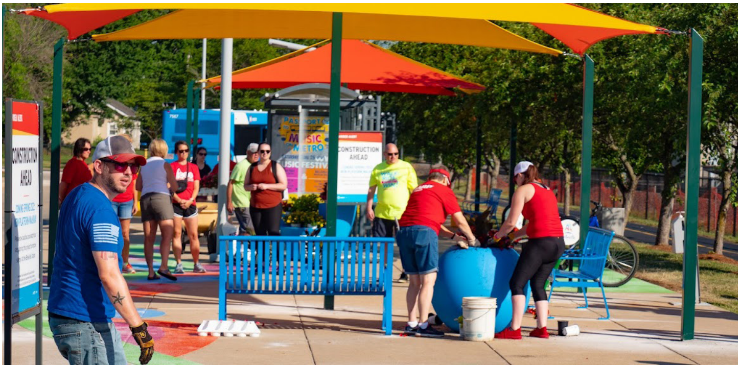
The Belleville transformation included a community plant day to engage residents, riders, and stakeholders to build ownership.

The final step was the promotion of this new amenity to the community as well as the region as a whole. In addition, programming around the station was a top priority.