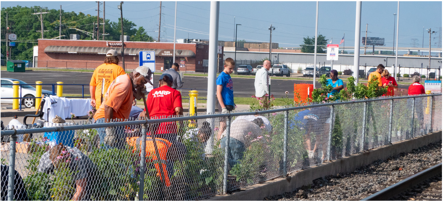
Dozens of volunteers rolled up their sleeves and planted nearly 450 flowers and bushes to create an urban oasis at the 5th & Missouri Transit Center in East St. Louis.