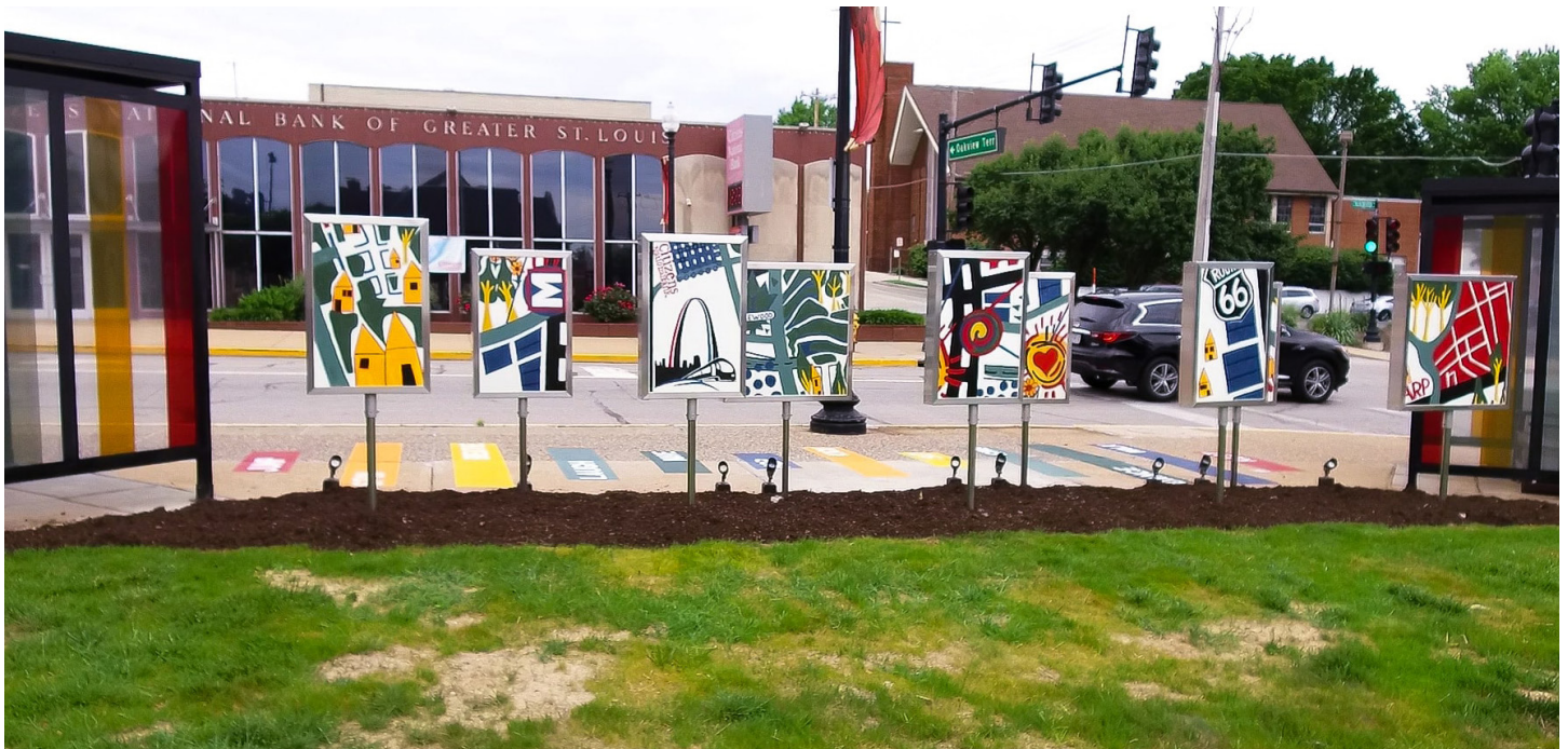
The Maplewood bus stop transformation included renovated shelters, seating, and art. Citizens National Bank owned the property where the shelter was located.

The process included RFPs for an architect for site work and artist for community art portion.