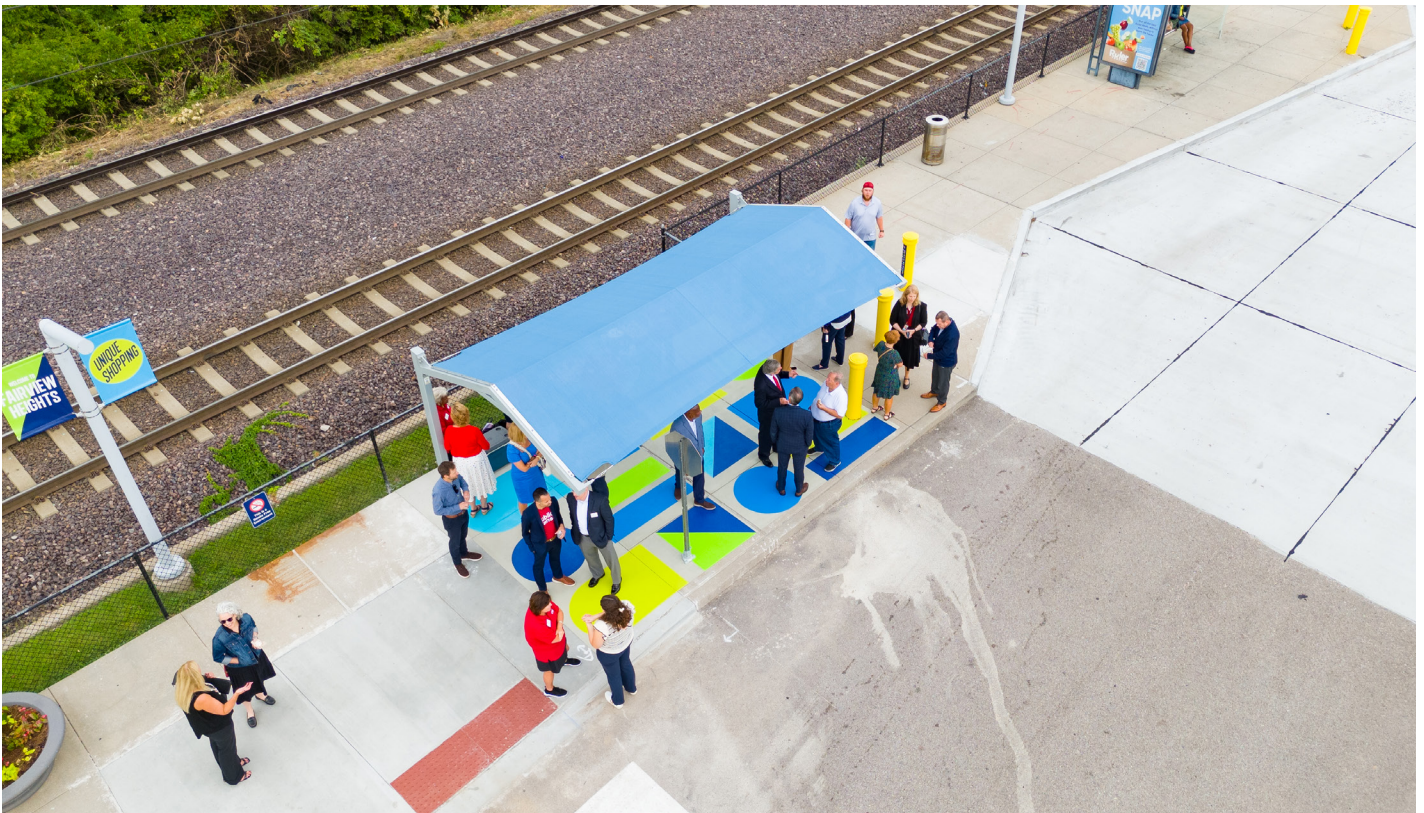
The Fairview Heights transformation included a new community seating area between light rail entrance and bus bays.