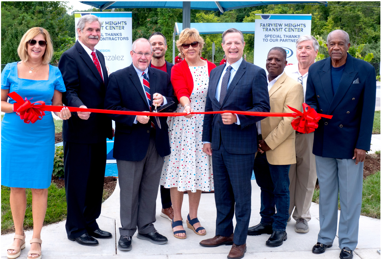
Partners and stakeholders cut the ribbon on the 6th transit transformation on August 21, 2024.