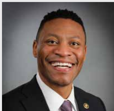
SENATOR BRIAN WILLIAMS District 14 – St. Louis County