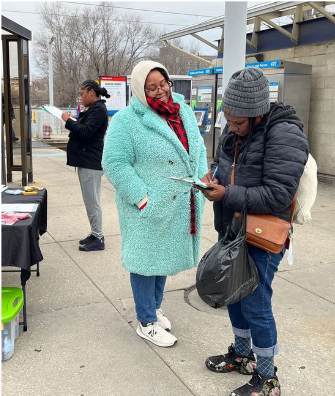
Community engagement for the transformation at the 5th & Missouri Transit Center ran through March 2023.

Events and outreach included onsite surveying of transit riders at the station, Engagement Street Team, attendance at community events, pop-up events, social media outreach, engagement with operators at the bus garage in Illinois, engagement with elected officials, direct mail to households within one mile of the station, local newspaper ads, transit ads, and a web survey to determine the following: