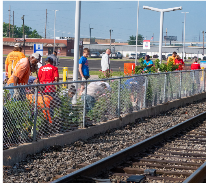
Dozens of volunteers rolled up their sleeves and planted nearly 450 flowers and bushes to create an urban oasis at the 5th and Missouri Transit Center in East St. Louis.