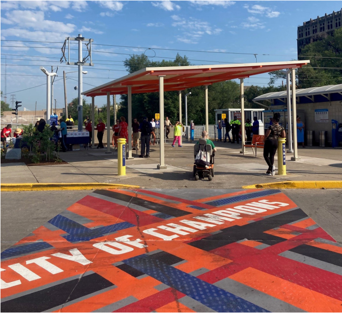
This transformation features a “City of Champions” theme.