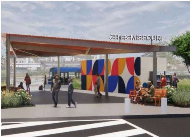
Architect Rendering of possibilities for the building. Below is current state of building, crosswalk.