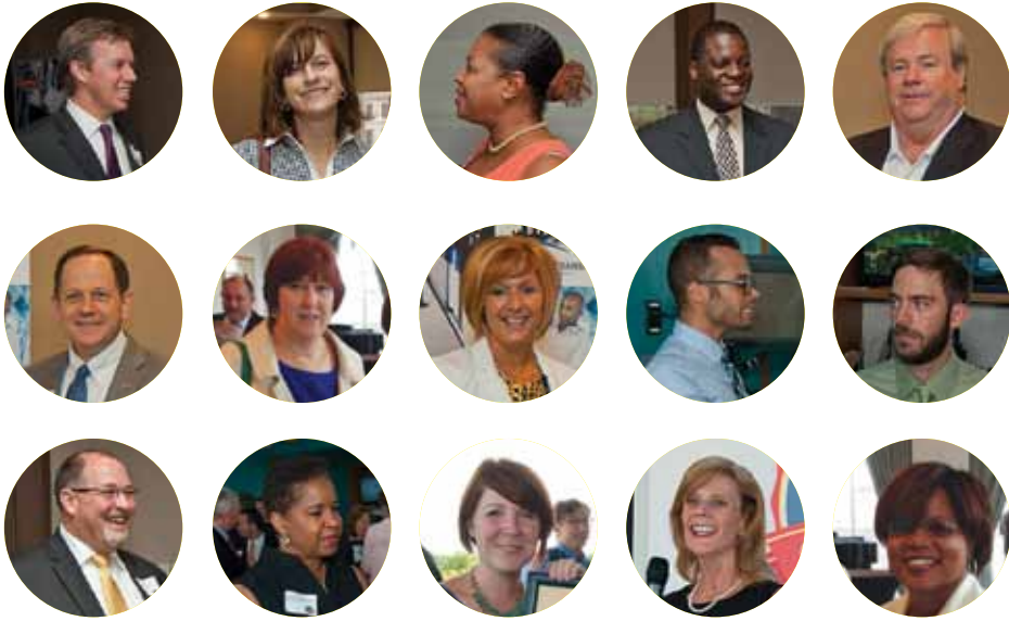
CMT Providing the Voice for Transit Choice: CMT Board members, elected officials and community stakeholders

CMT was awarded several grants in FY2015. This list includes an American Public Transit Association grant to support the Try & Ride program; a Great Rivers Greenway grant to expand work on the connections between transit and greenways; and a new Congestion Mitigation and Air Quality grant to build new ridership programs to entice new riders to the system.