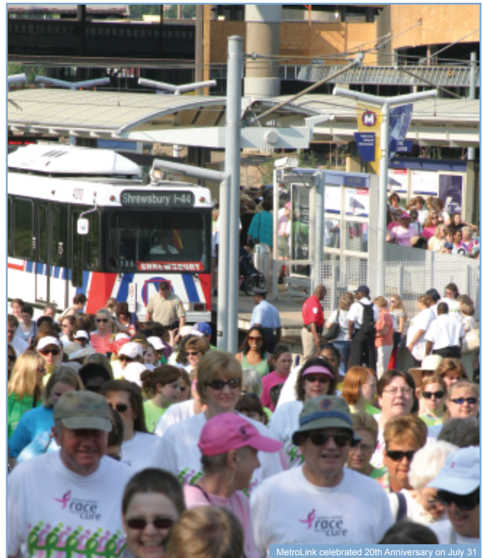
MetroLink celebrated 20th Anniversary on July 31

In FY14, we will be focused on building new connections so we can meet the new challenges that lie ahead. Let's take the energy from celebrating 20 years of MetroLink success in St. Louis and ensure that our system continues to move ahead and meet the needs of the St. Louis region over the next 20 years. Now is the time to invest in transit and in CMT. We hope you will get on board!