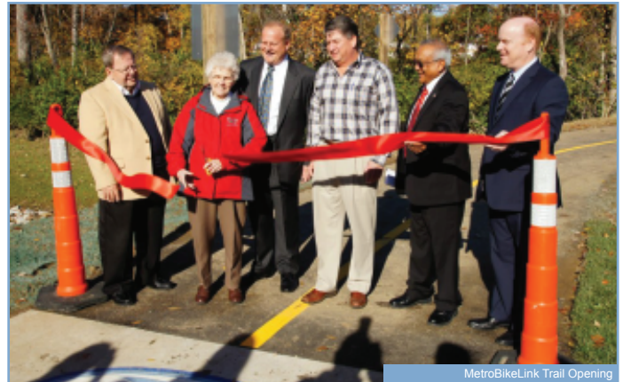
MetroBikeLink Trail Opening

Last fall, CMT also worked hand in hand with the St. Clair County Transit District to introduce Phase II of the MetroBikeLink Trail in St. Clair County, Illinois. With the expansion, the trail now spans 6.9 miles along MetroLink in Illinois.