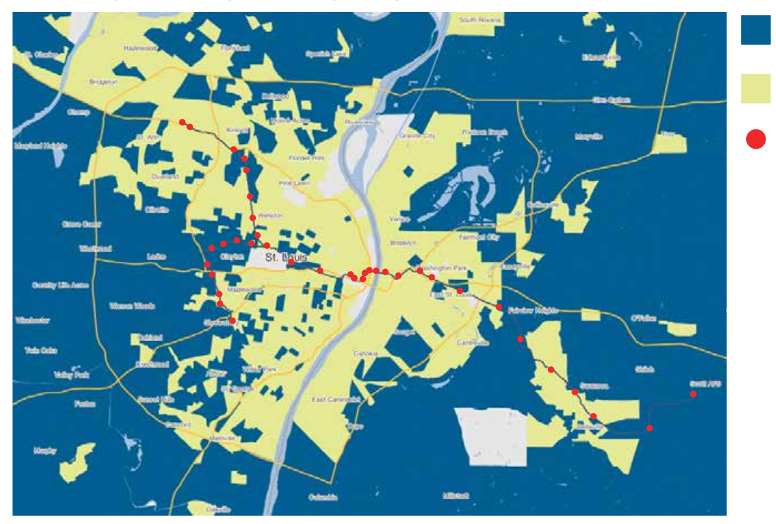
Center for Neighborhood Technology Housing and Transportation Affordability Index, www.cnt.org, July 8, 2013.

This graphic reveals that households located in areas near the MetroLink line across both Missouri and Illinois paid less money in an average month on the combination of housing and transportation costs, compared to outlying areas in the region not served by MetroLink. The light rail system offers a benefit to nearby households, in that using the MetroLink system reduces a household's total budget for transportation and housing. Future TOD in the region should leverage this advantage in marketing housing products to prospective consumers.