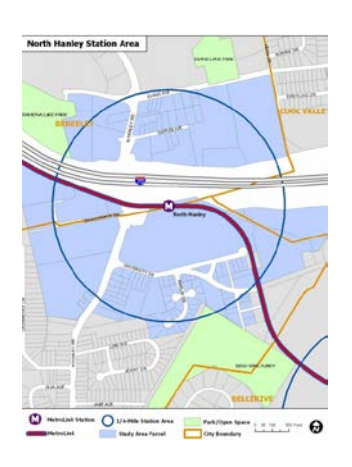
Diagram by permission from Metro St. Louis

Of the area immediately surrounding the N. Hanley MetroLink site there is strong development prospects to the south, and some potential to the east around the retention basin or watershed area between the station and Express Scripts. There are many strong amenities within close proximity of this station.