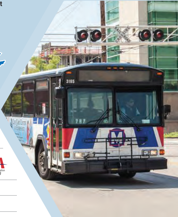
Missouri Transit Operating Investment Trends