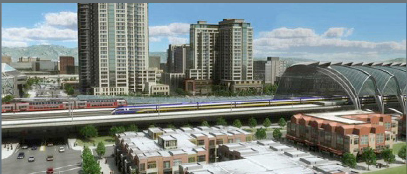
Rendering of Diradon Station and future HSR-oriented development.

See entire HSR TOD MarketPlace report: www.hsrtodmarketplace.org