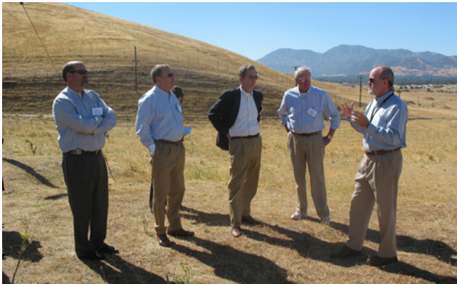
The ULI panel tours the 5,000 acre redevelopment site in Concord.