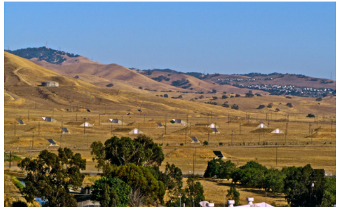
Old munitions bunkers on the Concord Naval Weapons Station Reuse site.

A major redevelopment plan that aims to attract a significant amount of new private investment is likely to require a sizable commitment of funds and implementation support from the City. Especially when the uses or densities proposed represent a significant change from what currently exists, the cost of needed infrastructure upgrades may go beyond what a developer would be able to assume alone.